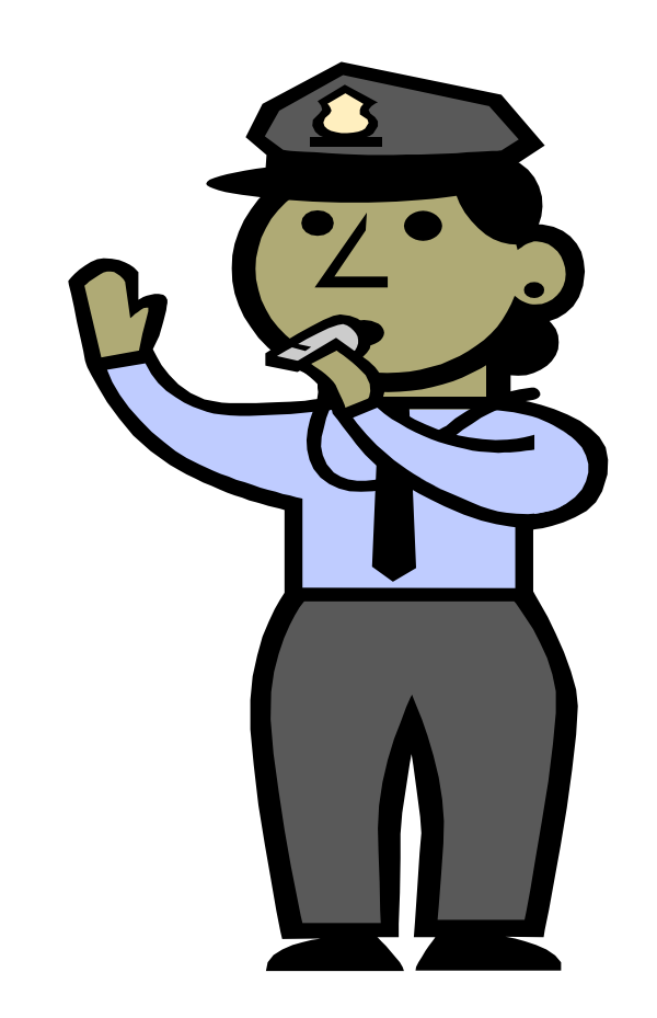
"SO...what have we learned today?"