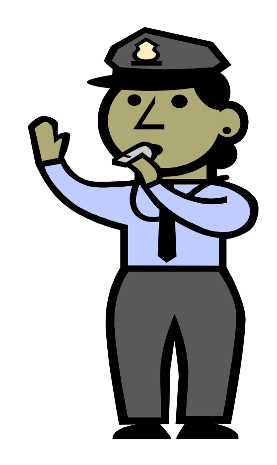
Rule Number Two:

Do not meet someone or have them visit you.